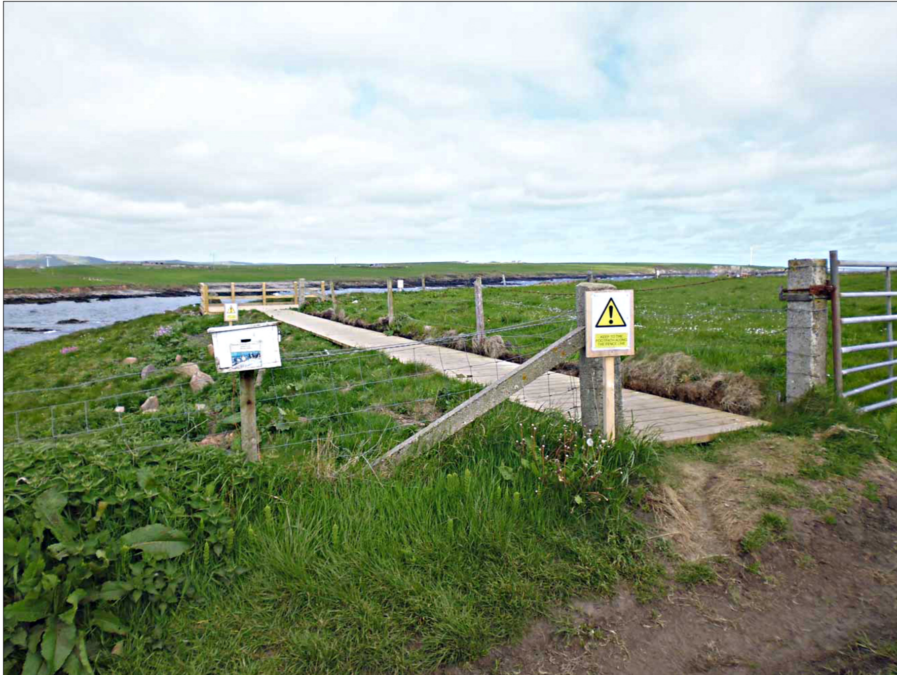
The beginning of the walk, approximately 1.2km (0.75 miles) total.