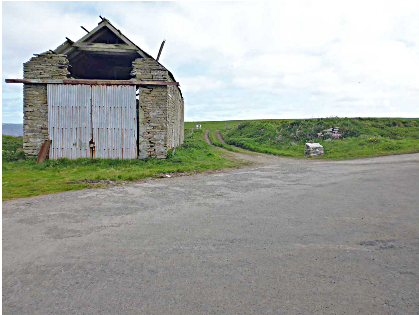
The car park is opposite this old mill.