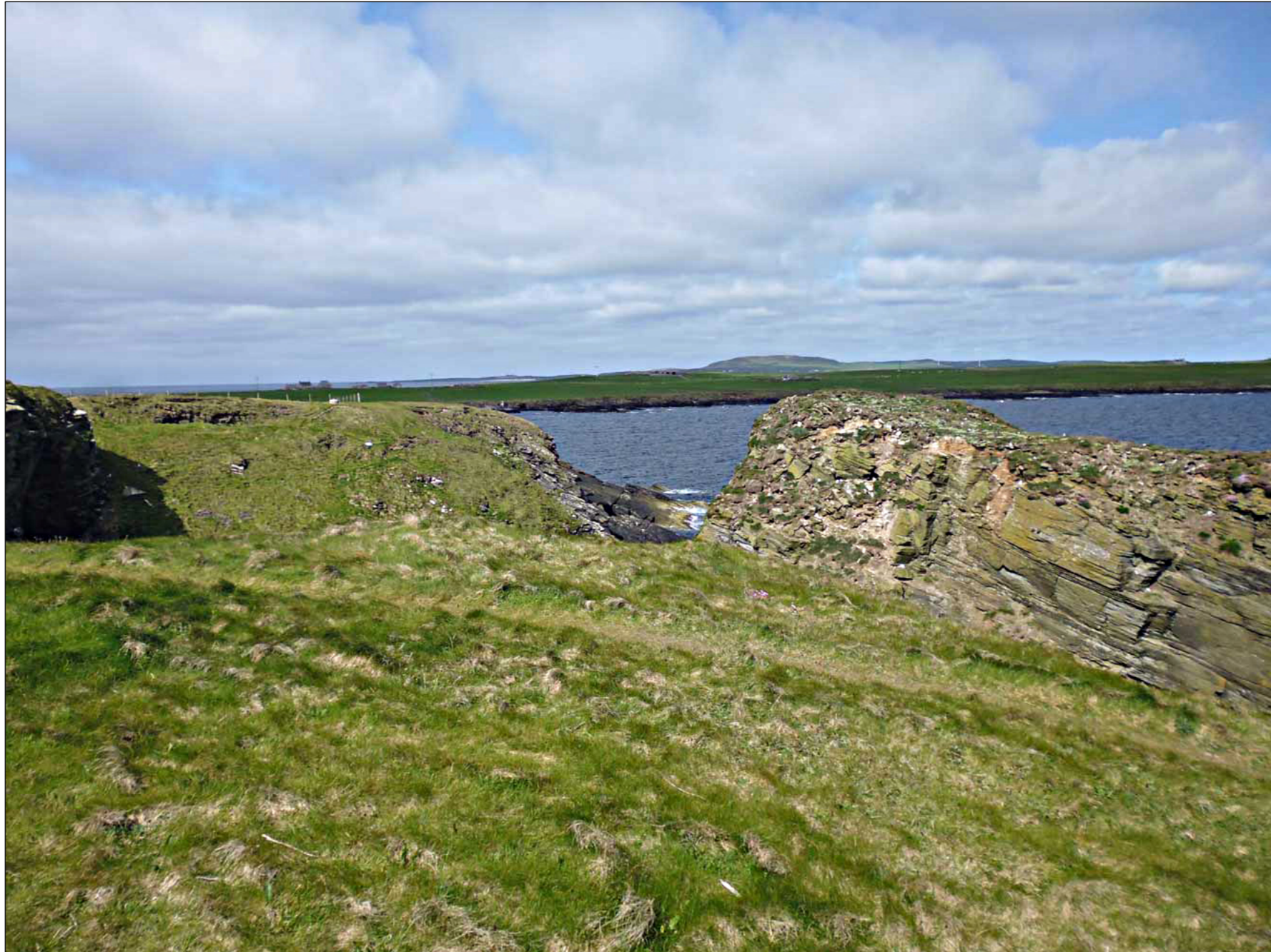
Heading back to the car park.