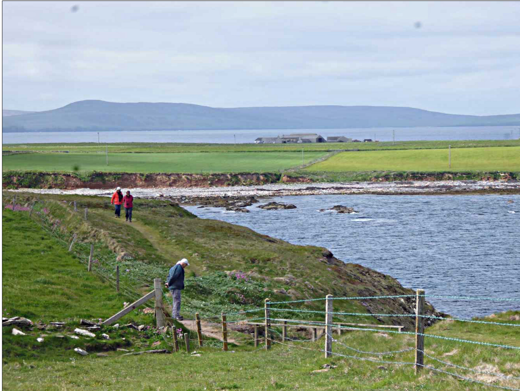
5 minutes away from the car park.