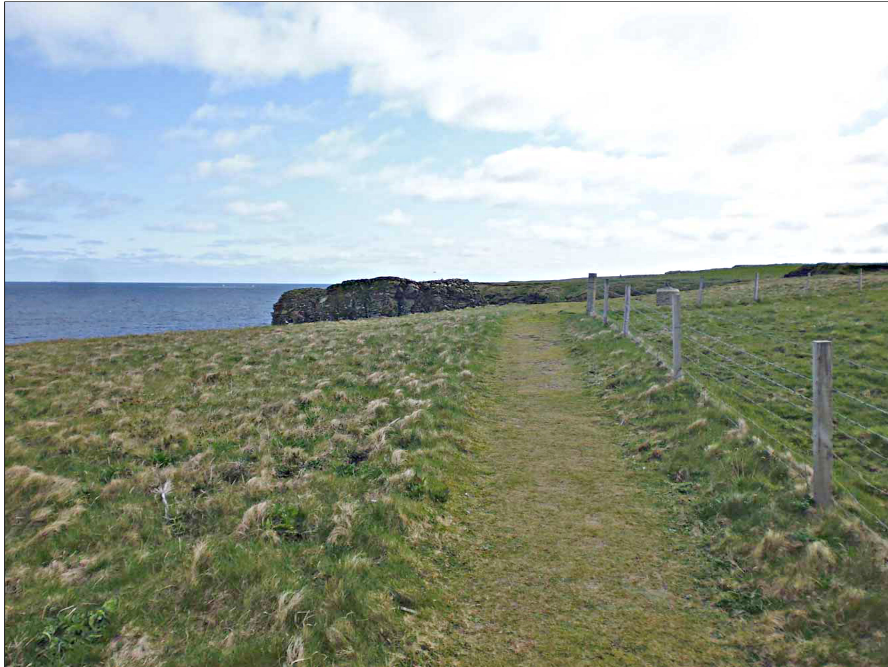
The rock castle is in sight.