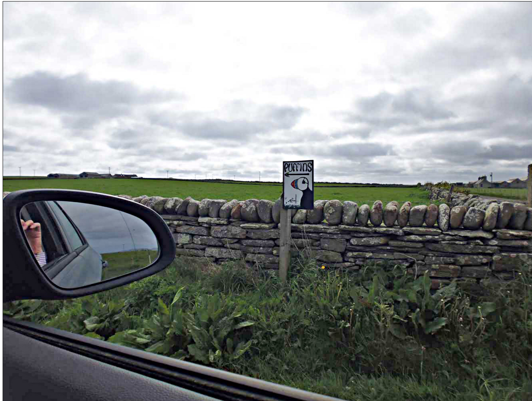
Entering the road down to the car park from the Rapness to Pierowall road.