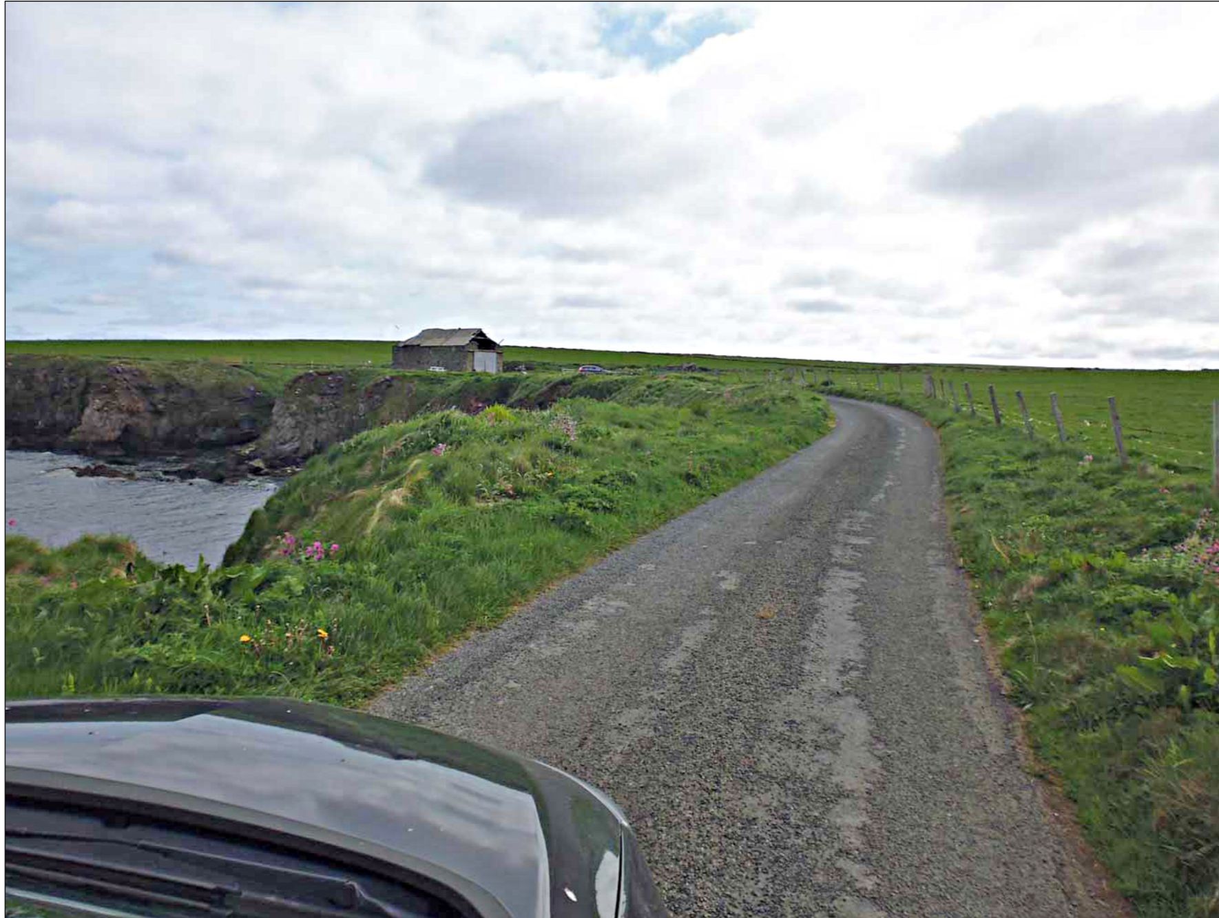
On to the car park by the old mill.