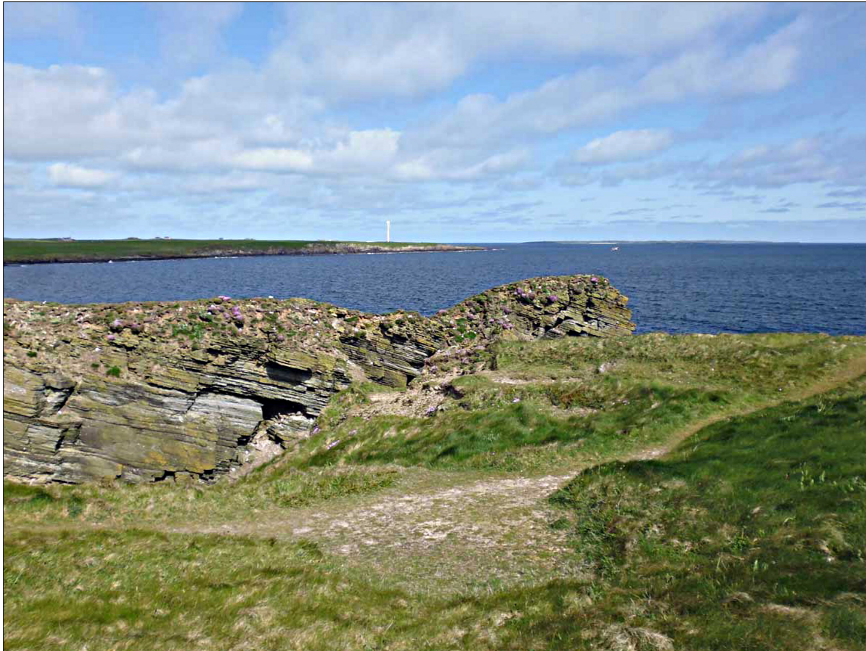
Looking towards Pierowall.