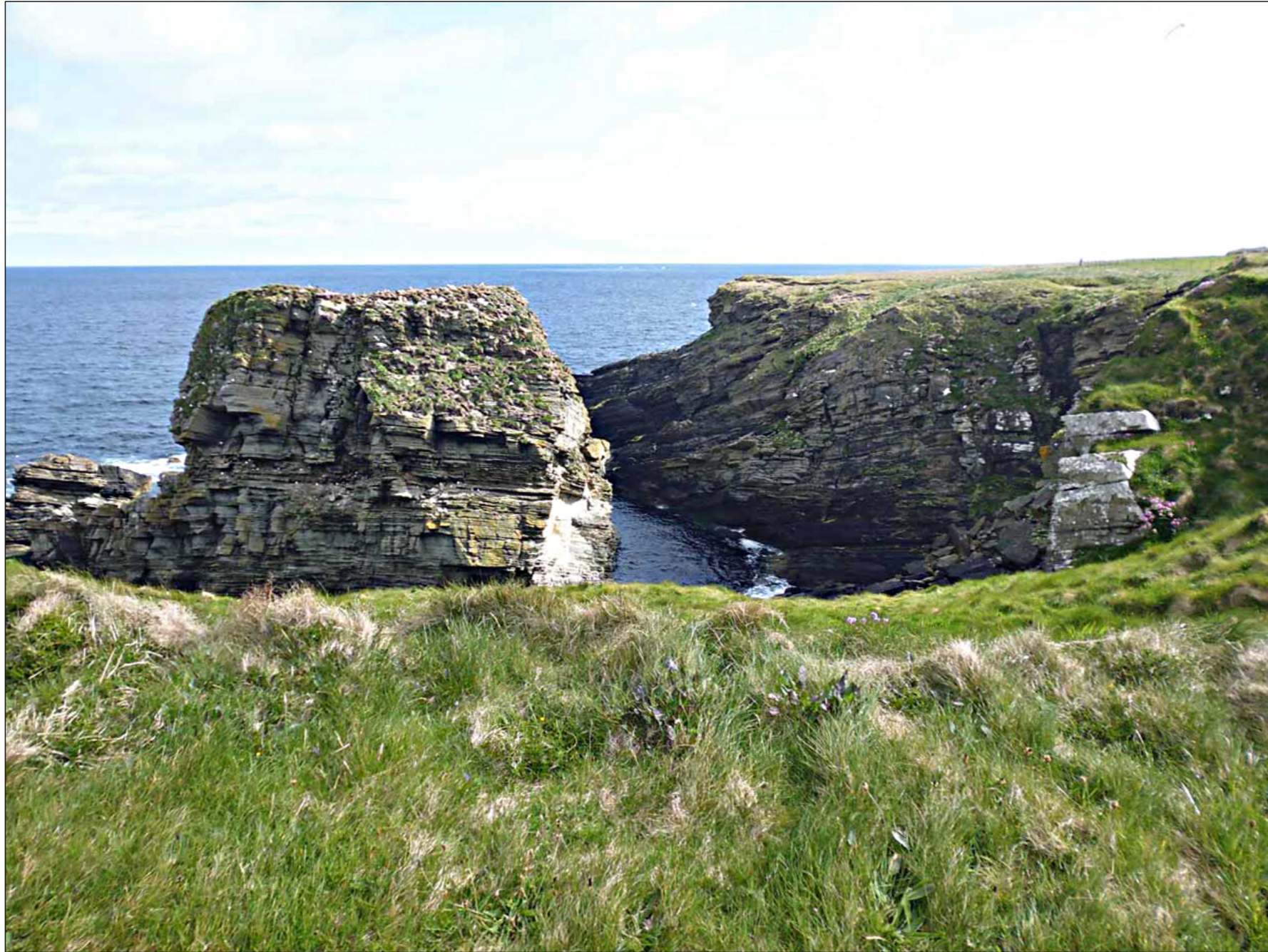
The Castle o' Burrian