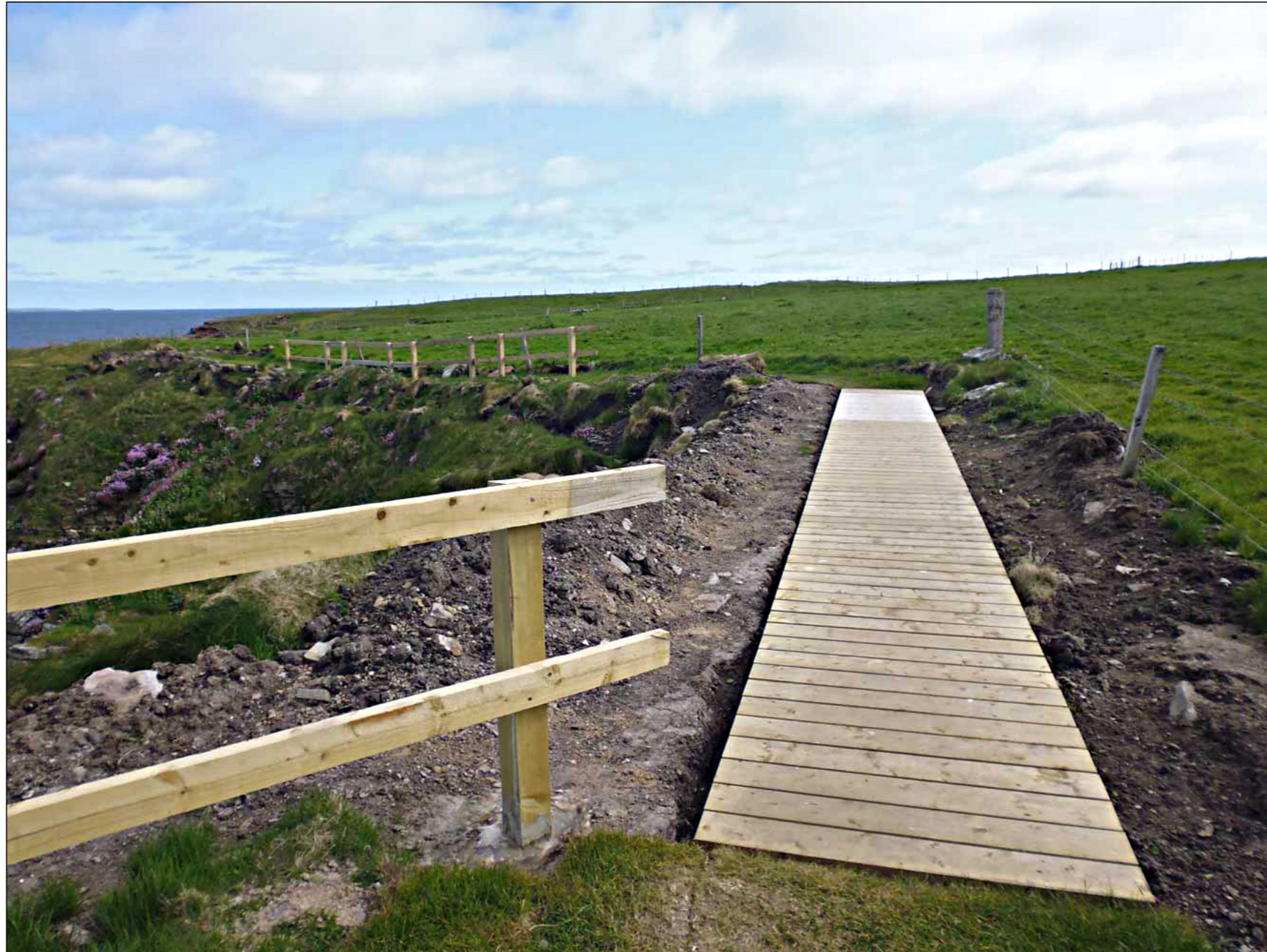
Staging has been laid where there were difficult or dangerous parts of the trail.